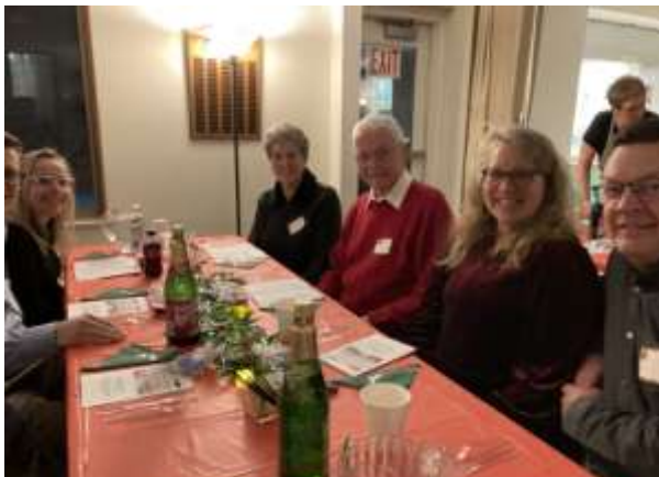
Members enjoy conversation as they wait for their number to be called