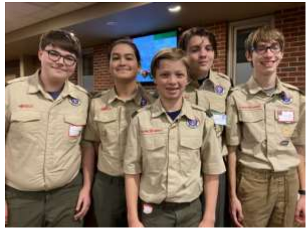
Scout Troop 9023, helped with serving the dinner